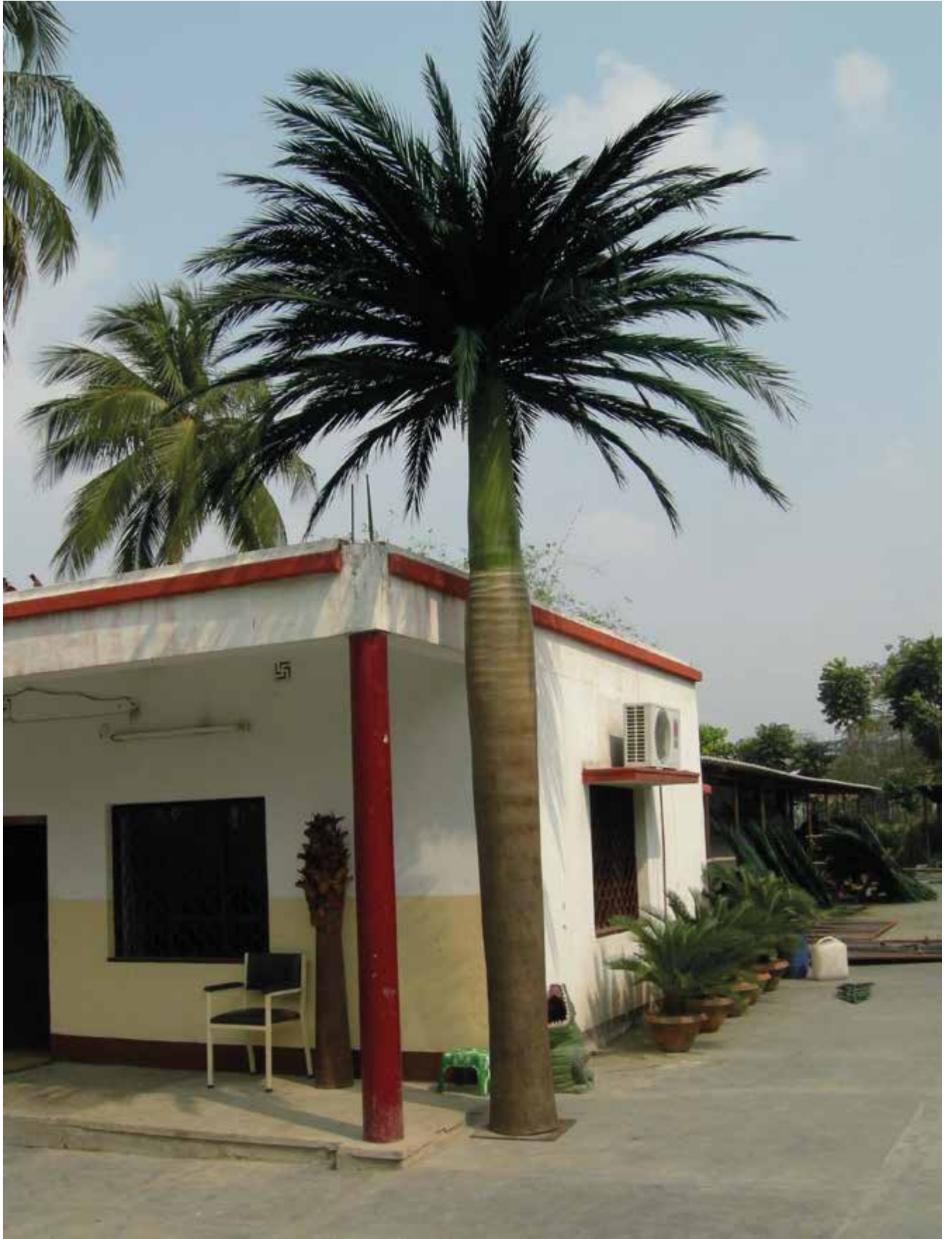
PRESERVED ROYAL PALM WITH ARTIFICIAL TRUNK