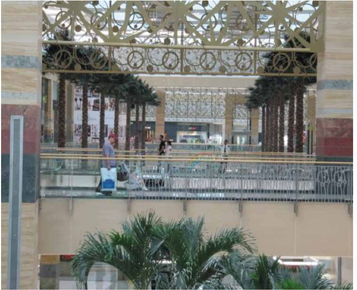
PRESERVED WASHINGTONIA PALM TREES MIRDIFF MALL, DUBAI