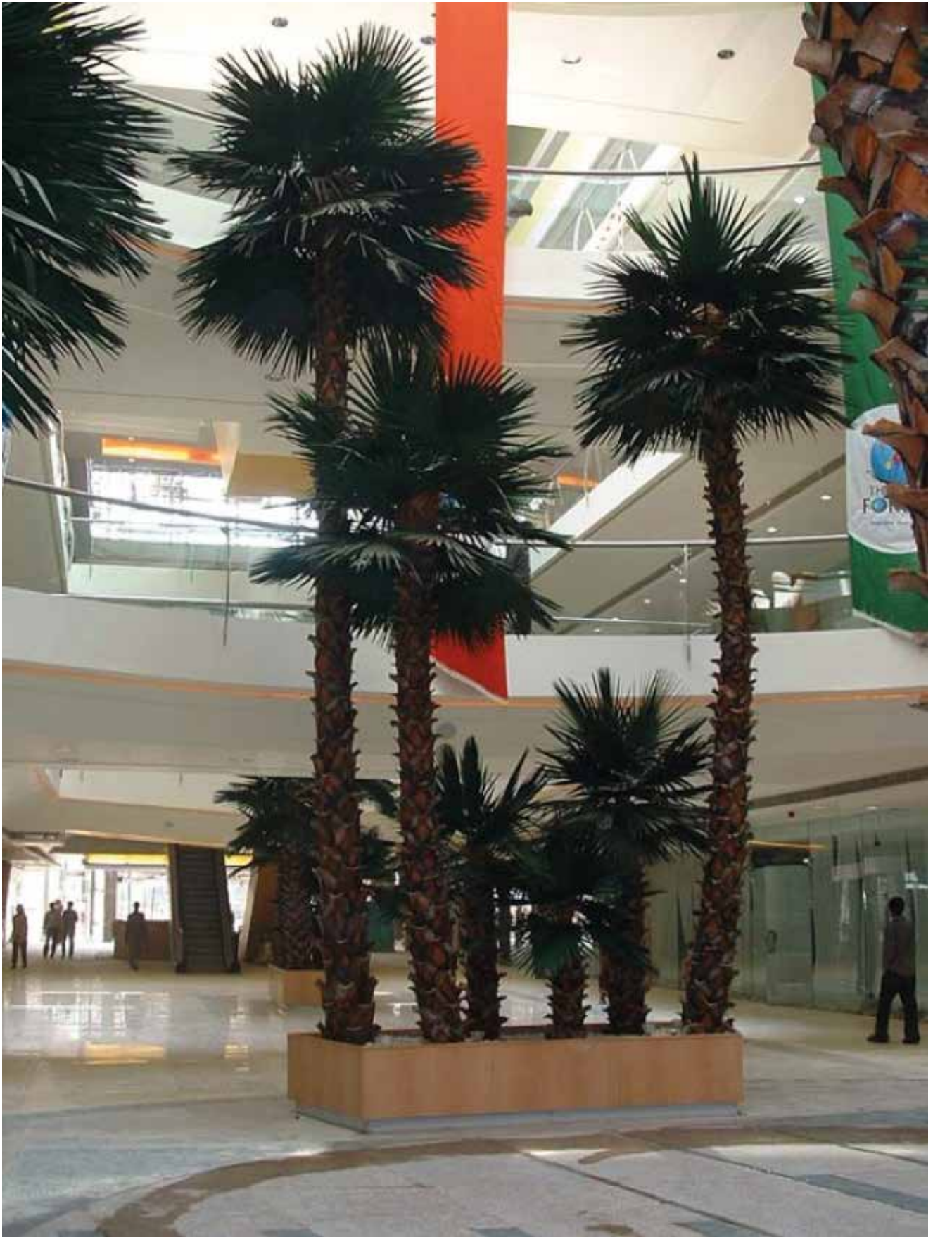
PRESERVED WASHINGTONIA PALM TREES CURVED FORUM MALL, BANGALORE