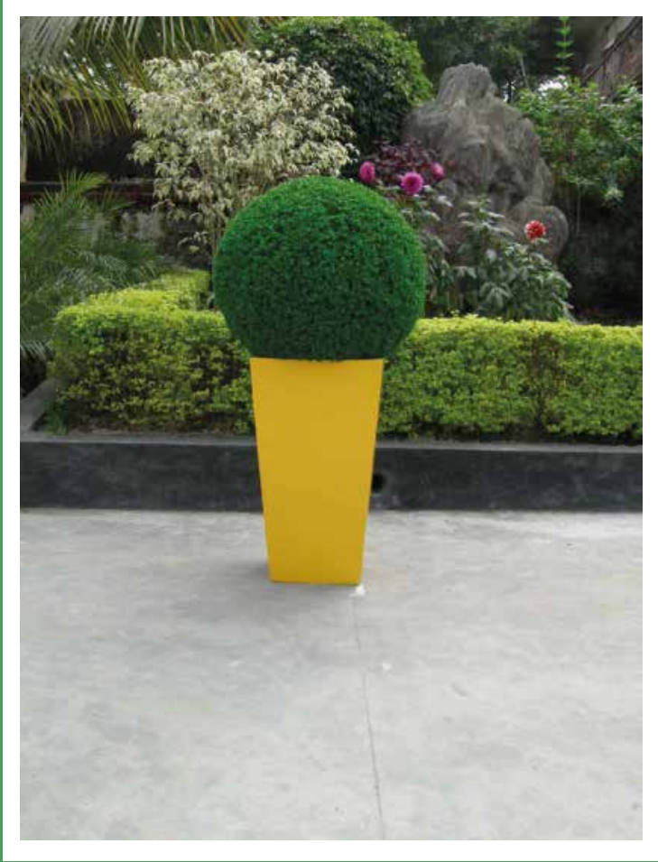
PRESERVED TOPIARY BALL AVAILABLE IN ALL DIAMETERS