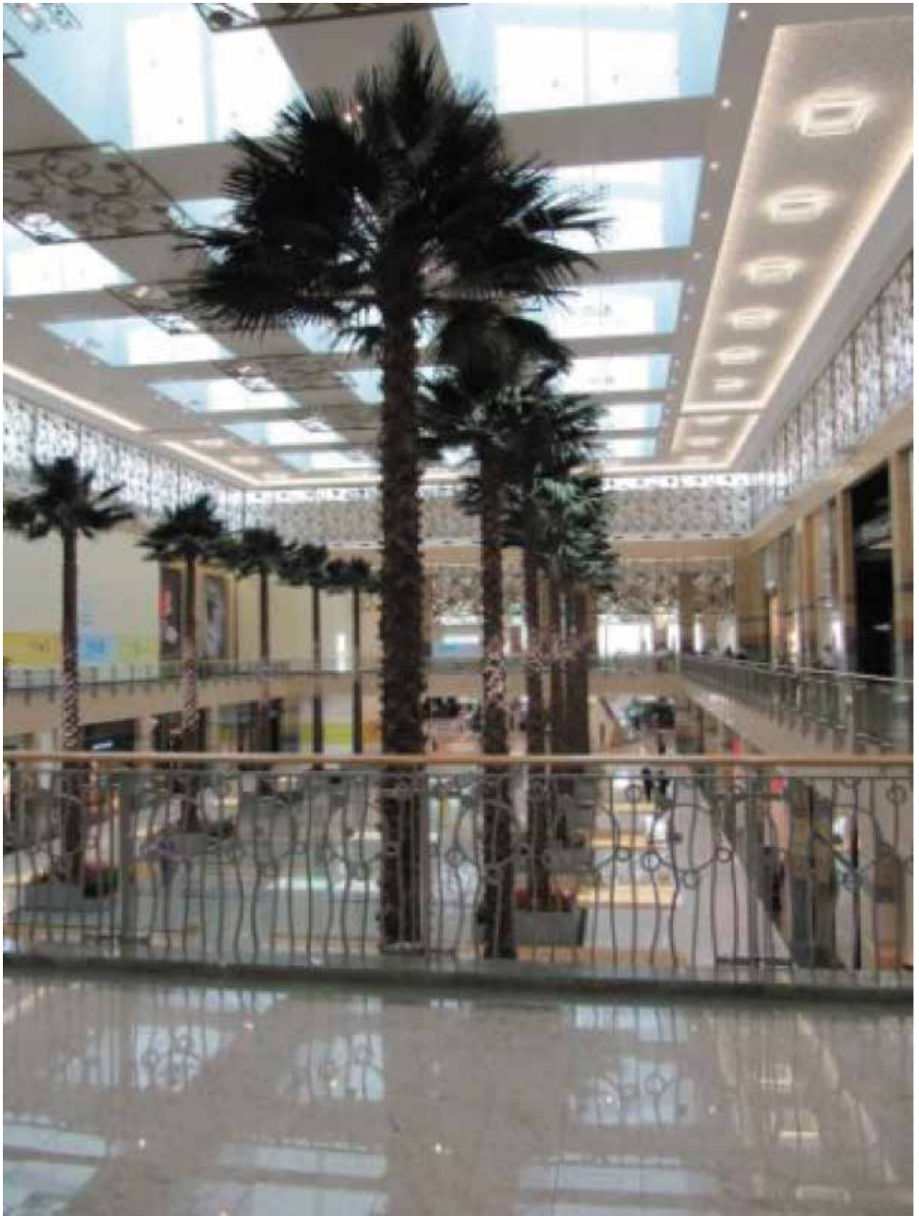
PRESERVED WASHINGTONIA PALM TREES MIRDIFF MALL, DUBAI