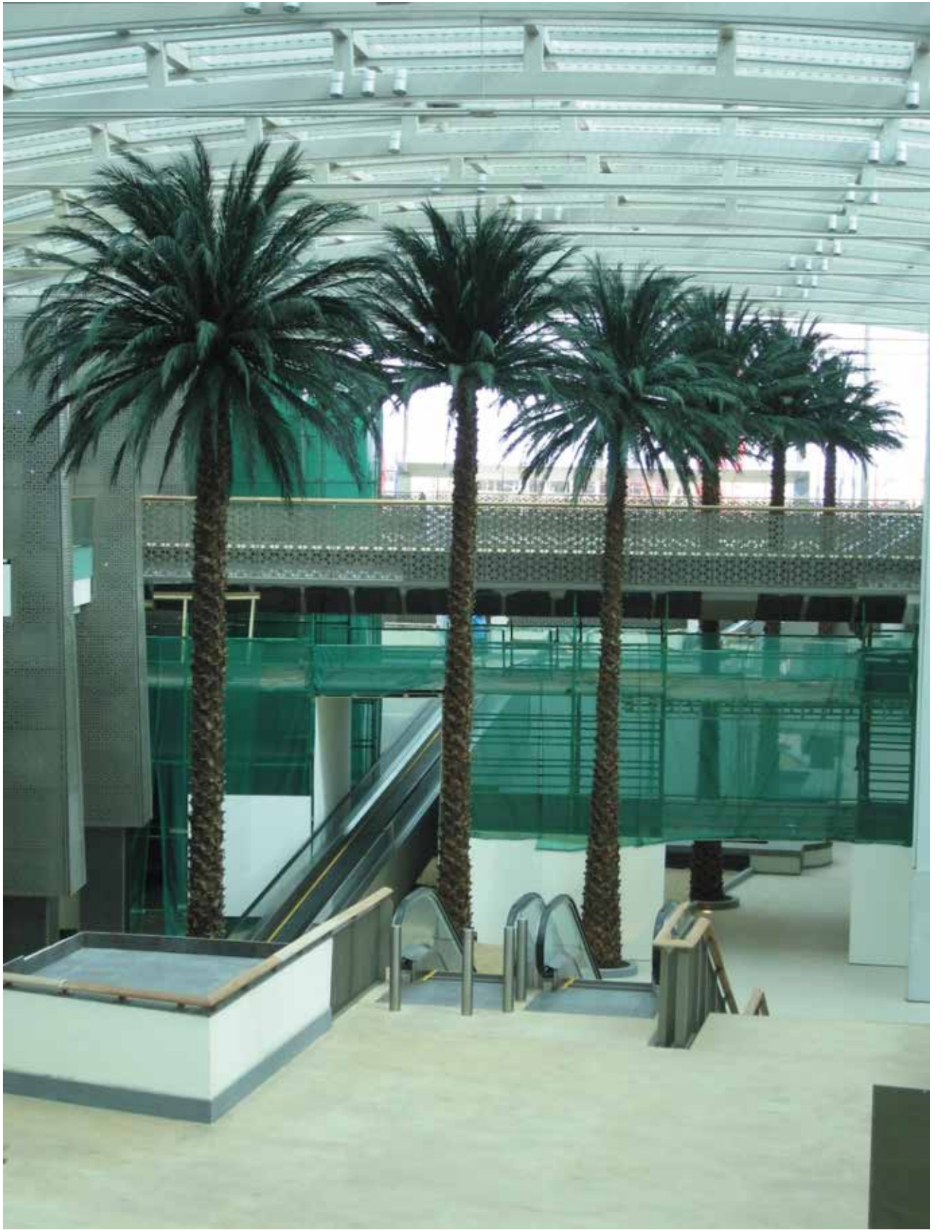
PRESERVED DATE/ PHOENIX PALM TREES 50FT DUBAI FESTIVAL CITY