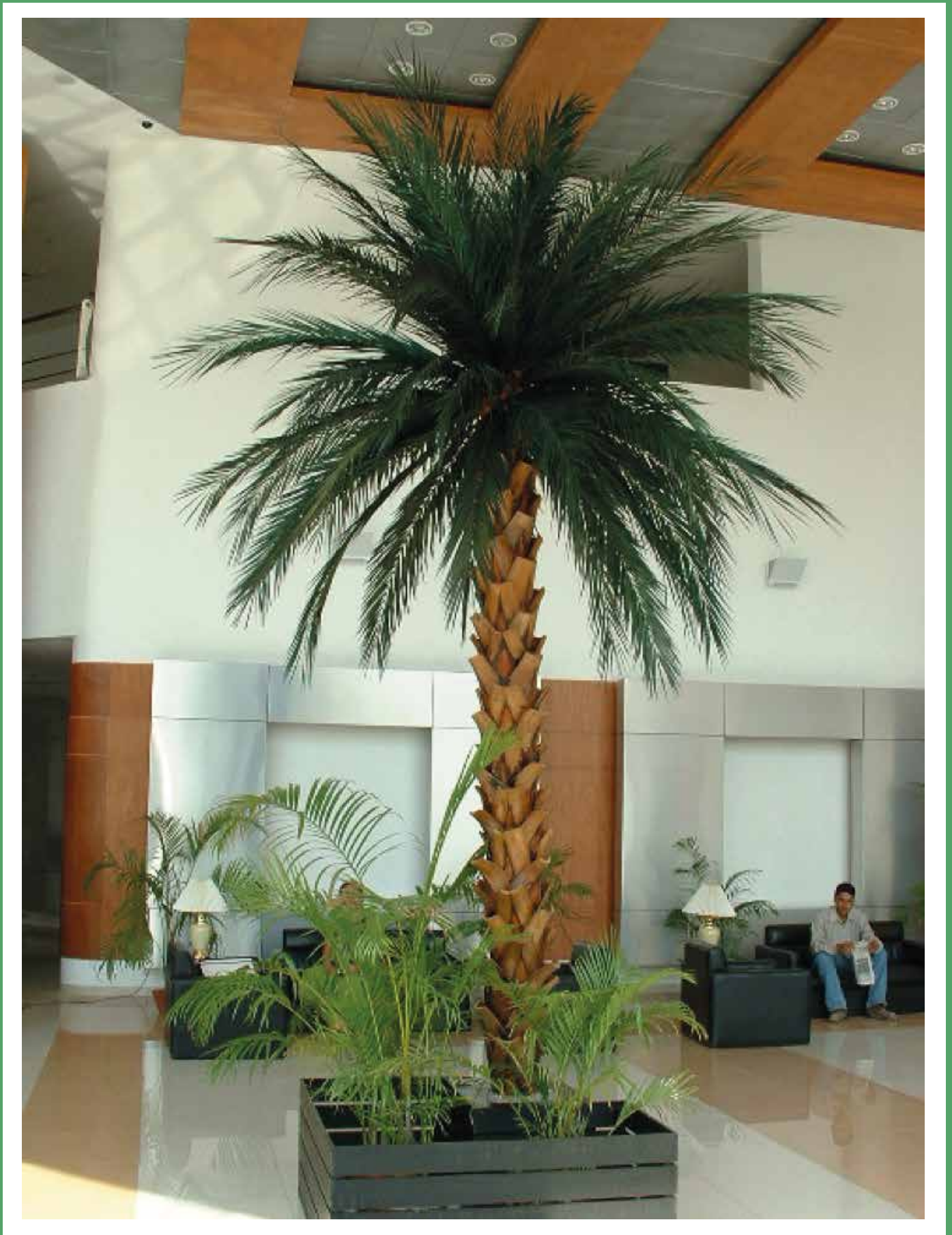
PRESERVED DATE/ PHOENIX PALM TREE 17FT COGNIZANT TECHNOLOGIES, KOLKATA, INDIA