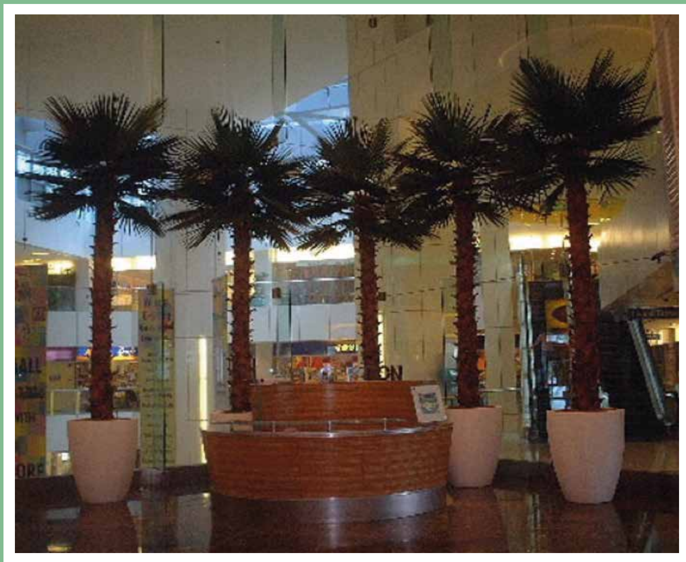
PRESERVED WASHINGTONIA PALM TREES UNITED SQUARE, SINGAPORE