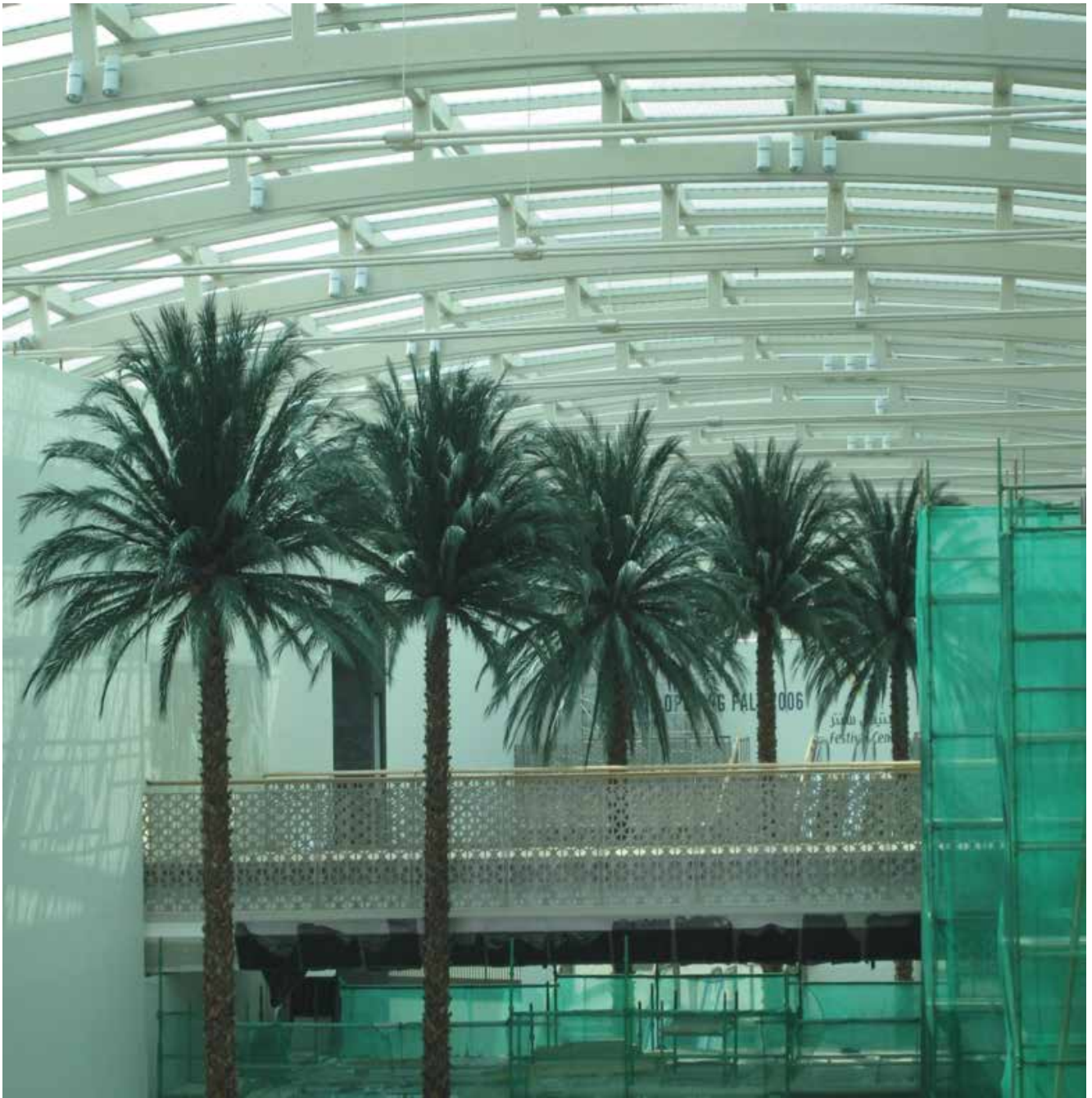
PRESERVED DATE/ PHOENIX PALM TREES 50FT DUBAI FESTIVAL CITY