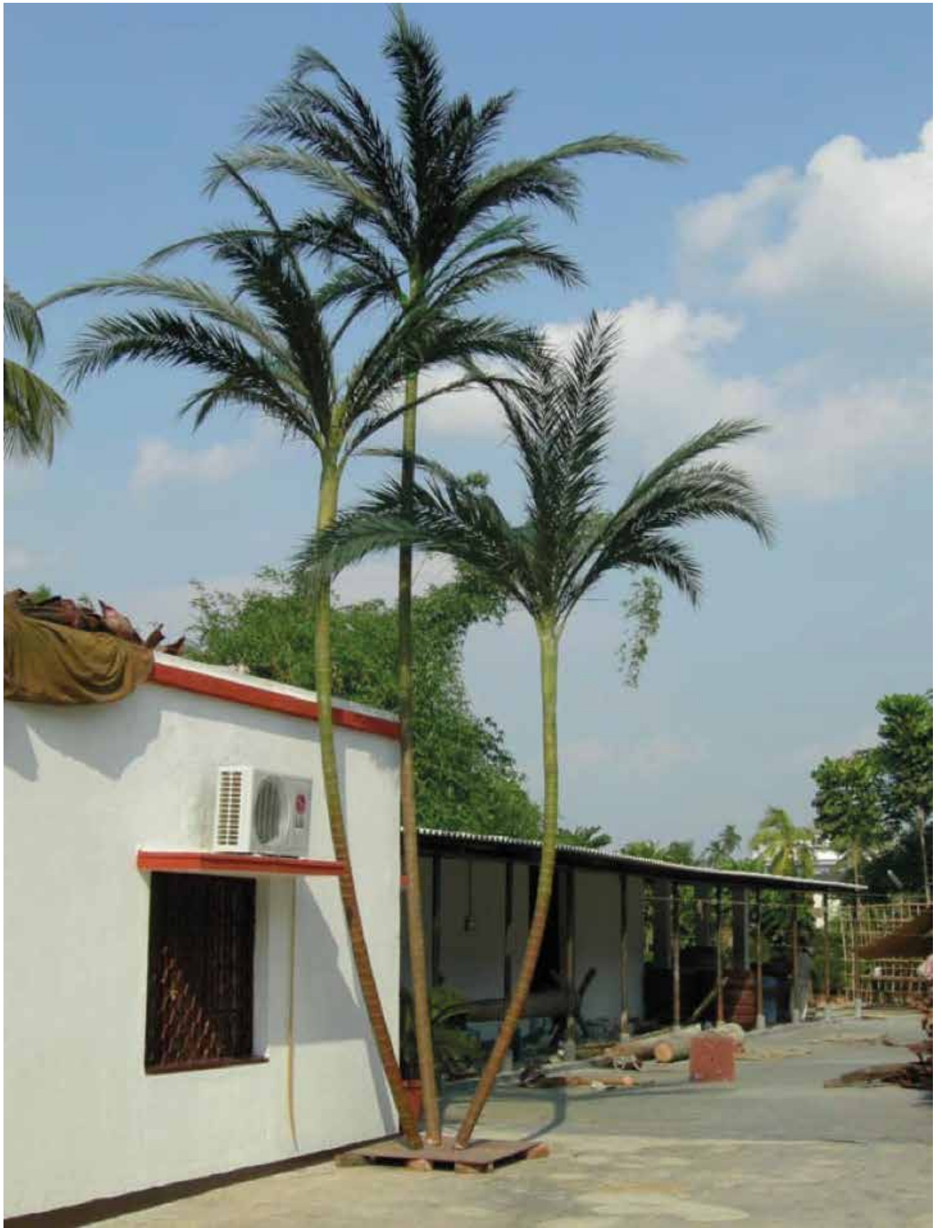
PRESERVED ARECA PALM TREES WITH NATURAL TRUNK