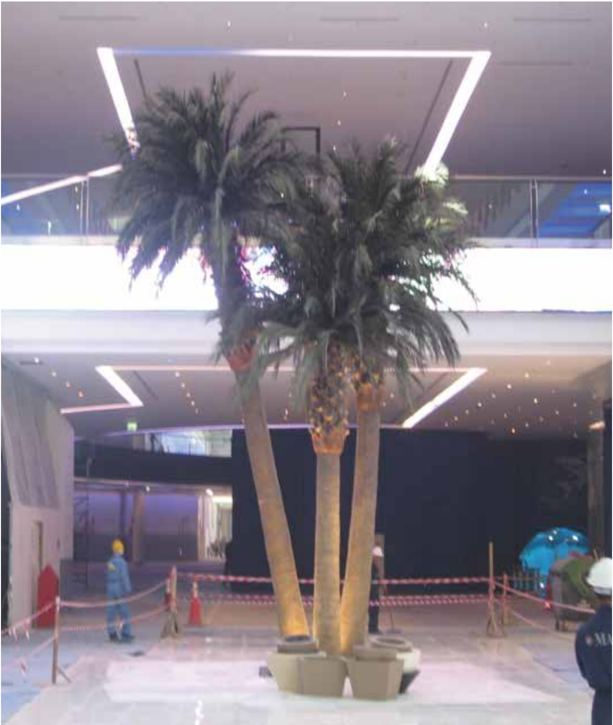
PRESERVED DATE/ PHOENIX PALM TREE TRIO .WITH STRIPPED TRUNK DUBAI MALL