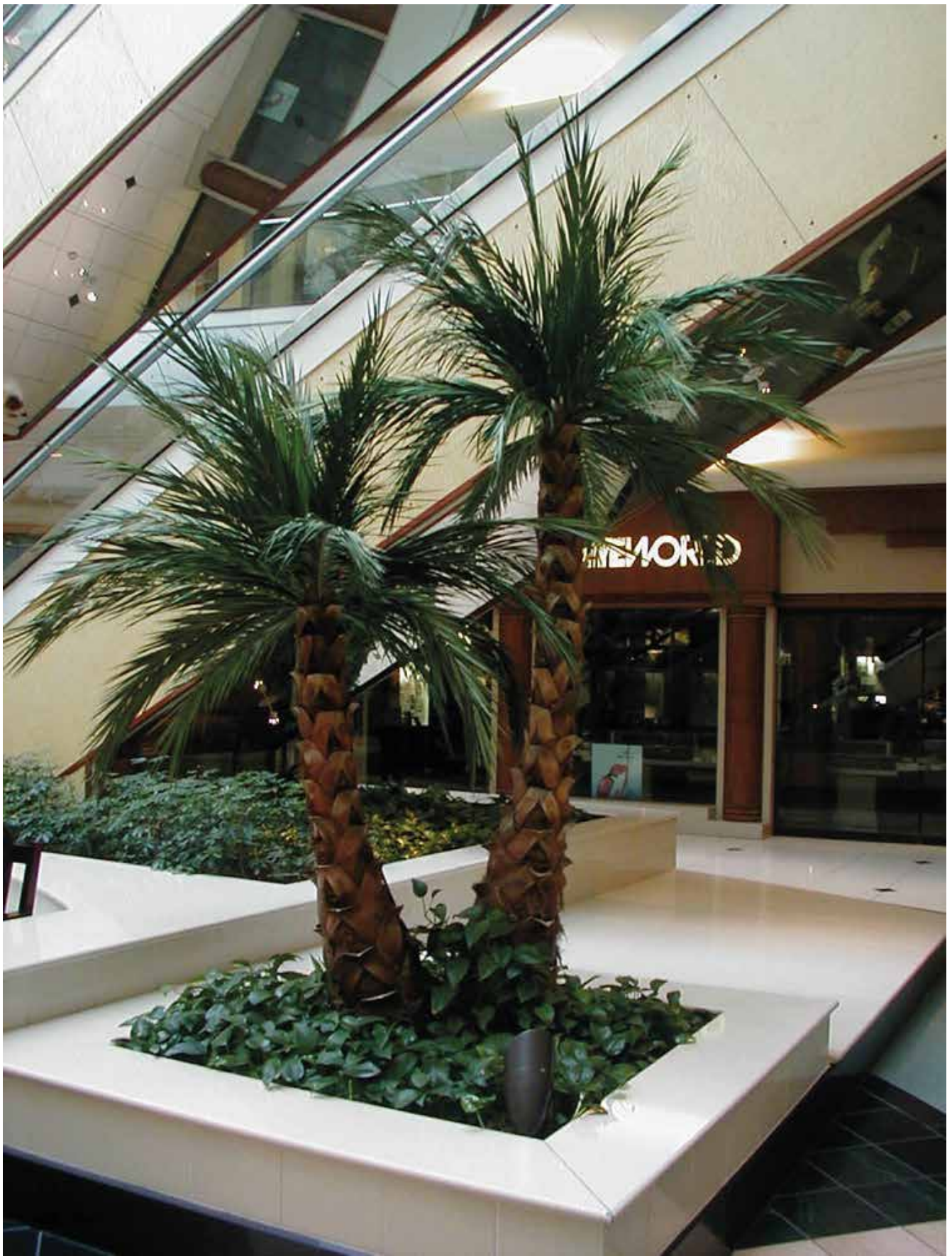
PRESERVED DATE PALM TREES TWINS SOMERSET MALL, USA