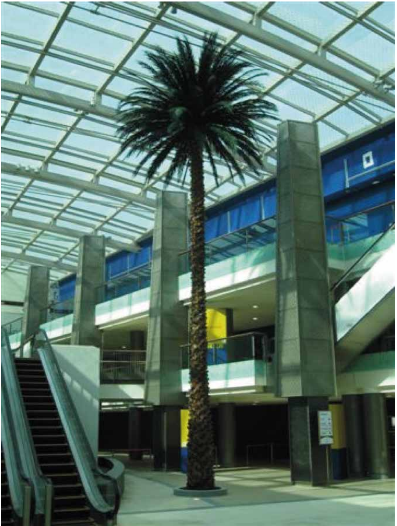
PRESERVED DATE/ PHOENIX PALM TREE 50FT DUBAI FESTIVAL CITY