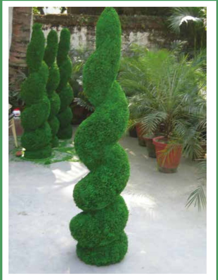
PRESERVED CURVED TOPIARY IN ANY HEIGHT