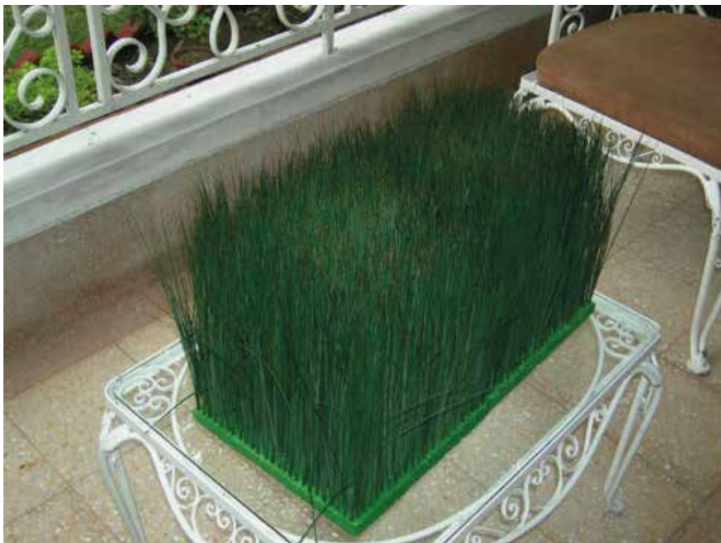
PRESERVED GRASS TILES